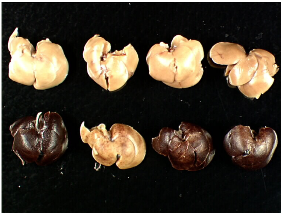
Figure 2. Macroscopic pathology of fixed livers from Male Swiss Albino mice (IOPS OF1 strain) treated with toxic extracts (unpublished results from Mathilde Harvey, AFSSA Paris). Top row from left to right: two mouse livers injected with 0.9% NaCl and two non-perfused mice livers as controls. Bottom row: liver of mouse injected with an extract (20 mg lyophilised sample/mL, 0.9% NaCl used as extraction solvent, i.e. 1000 mg lyo/kg of body weight) of a field sample of Planktothrix agardhii (producing microcystins) and with culture extracts (5, 10 and 20 mg lyophilised sample/mL, 0.9% NaCl, i.e. 250, 500 and 1000 mg lyo/kg of body weight) of Cylindrospermopsis raciborskii (producing cylindrospermopsin).

viewed as giving a selective advantage, since some zooplanktonic predators are susceptible to these toxins and avoid eating cyanobacteria [7, 23]. Finally, the control of cyanobacteria by parasites, typically viruses, is probably very slight ([114], Jacquet S., unpublished data).