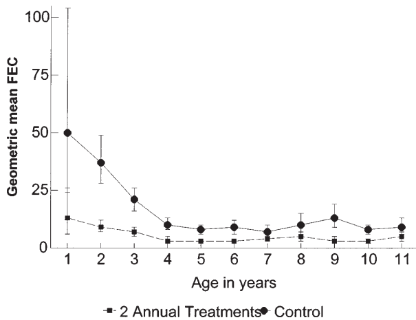
Figure 2. Age dependence of observed geometric mean faecal egg count by treatment group (error bars indicate 95% confidence intervals).

only after the age of five years. This is reflected in the effects of the control scheme on growth of the same animals, which is significantly improved between one and four years of age [24].